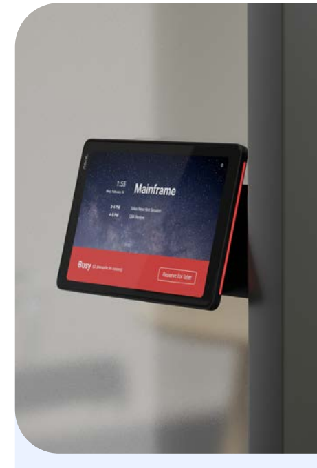
Scheduling Display provides room status and booking capabilities.

Make interactive collaboration and whiteboarding easy with all-in-one touch displays designed specifically for Zoom Rooms.