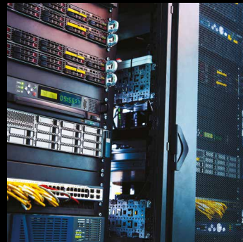
Infrastructure and Connectivity