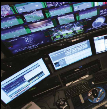
KVM Matrix Switching and Extension