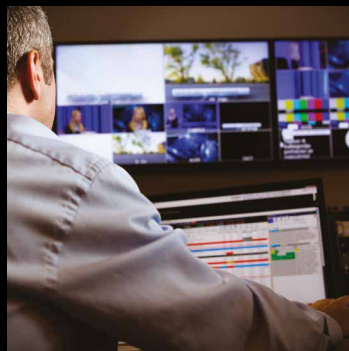
Simplified User Experience