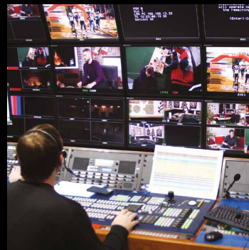
Video Wall Controllers