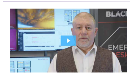
Video: Emerald DESKVUE System Demo ▶