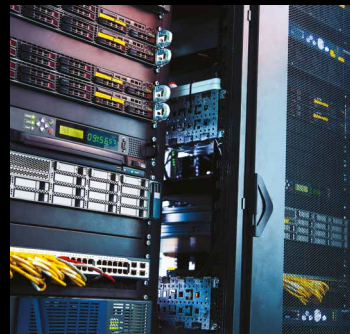
Infrastructure and Connectivity