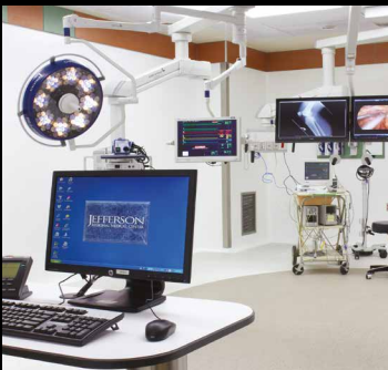
Signal Switching and Extension