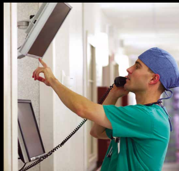
Visual Communications and Wayfinding