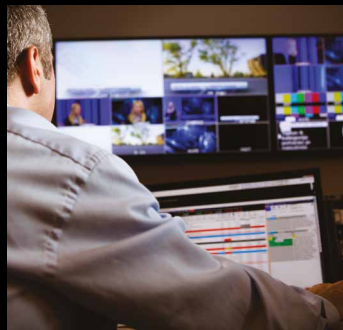
Simplified User Experience