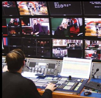
Video Wall Controllers