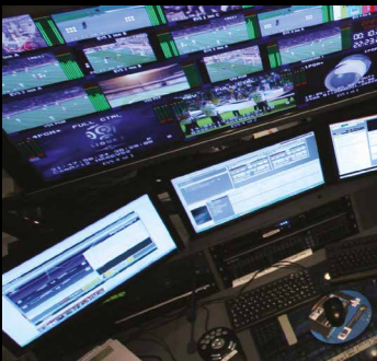
KVM Matrix Switching and Extension