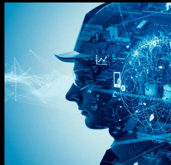
Industry 4.0 Automation through Sensors