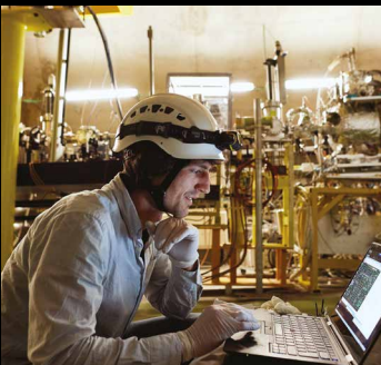
Redundant and Remote Networks