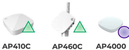
AP410C AP460C AP4000