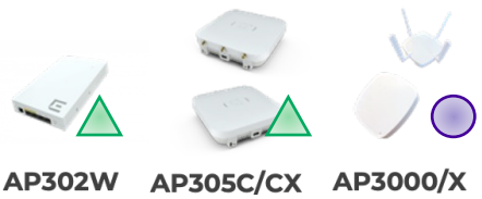
AP302W AP305C/CX AP3000/X